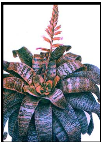
Two of the small group of the foliage Vriesea species , which have provides genes for the thousands of colorful hybrids. Vr. fenestralis and a drawing by Kiti Wenzel of Vr. fosteriana ‘Red Chestnut’.